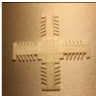
4-Way Internal Key