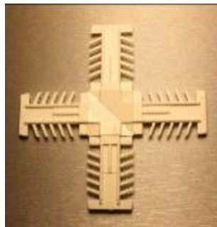
4-Way Centre Key