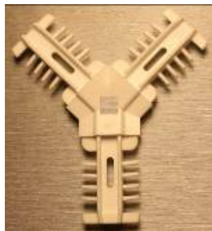
3-Way Square Buffer Centre Key