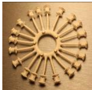
Square Buffer Insert H. 9.5 mm