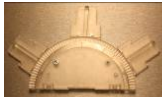
Adjustable Sunburst Kit for Variable Angles from 15° to 165°