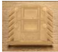
Staple End Connector