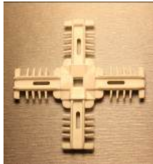
4-Way Square Buffer Centre Key