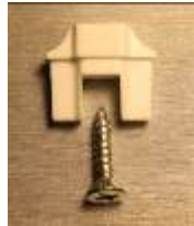
Saddle Clip Kit