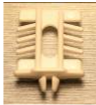
Clip End Connector