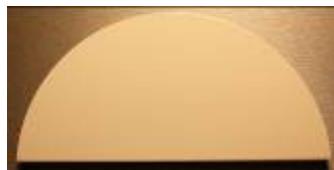
Semicircle Sunburst Cover