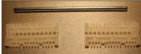
Assembling Set with Round Pin \phi 4 mm