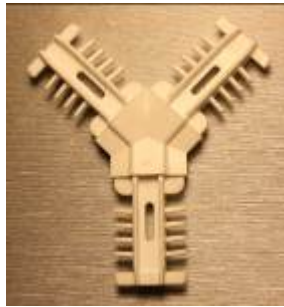
3-Way Centre Key